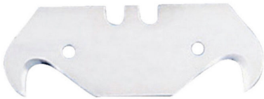
LC Spare blade "Hook"

See cwtworktools.com for complete model program and accessories.