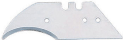
LC Spare blade "Concave"